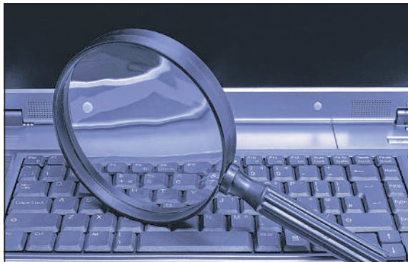
There are a number of options for keeping your passwords safe and secure.

monitor or in your top desk drawer, either.